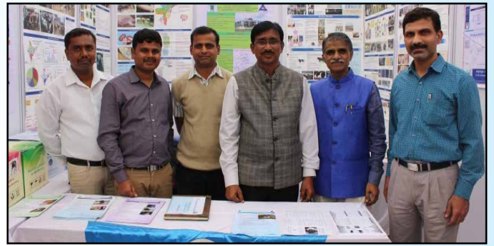
ICAR-NIVEDI participated in the Regional Horticulture Fair organized at ICAR-IIHR, Bengaluru during 15-19 th January, 2017 and exhibited institute research activities.