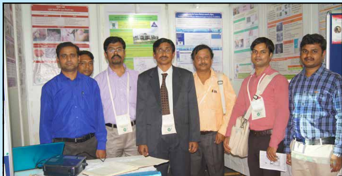
ICAR-NIVEDI participated in the 13 th Agricultural Science Congress held at GKVK, UAS, Bengaluru during 21-24 th February, 2017 and exhibited the institute research activities.