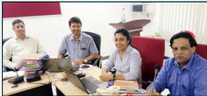
External Audit for ISO 9000:2015 certification of ICAR-NIVEDI was conducted by IRClass Systems and Solutions Private Limited, Bengaluru on 17 th June, 2017.