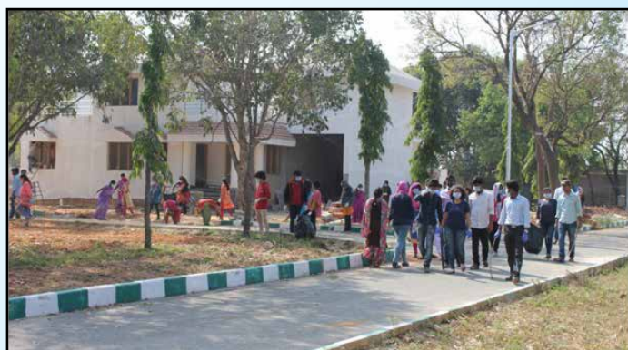
Swacchta Pakhwada was organized at ICAR-NIVEDI as part of Swacchh Bharat Abhiyan programme by cleaning the campus and laboratories during 16-31 st May, 2017.