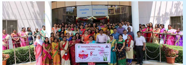
ICAR-NIVEDI celebrated the International Women's Day on 8 th March, 2017.